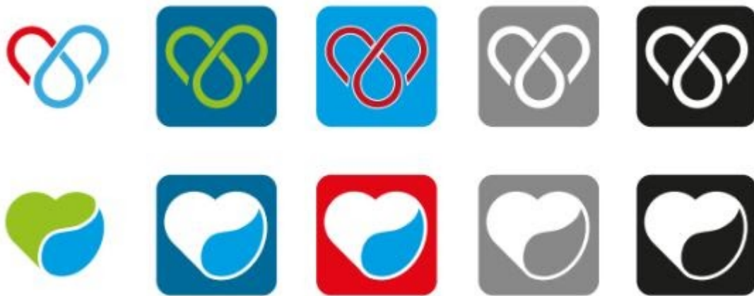
Study of logo for the smartphone application

The heart and the drop of water have been identified as pervasive elements of the AGEDESIGN project, therefore have been the focus of the logo studies.